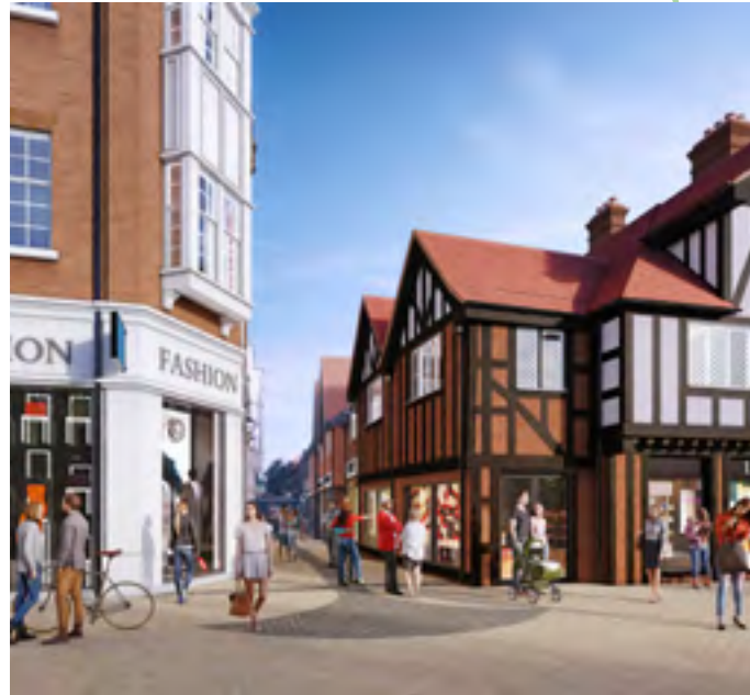
25-unit shopping centre, a six-screen cinema, cafés, bars, restaurants, open space, 240 new homes and a multi-level car park.

The town square will be brought to life using materials that match the local vernacular, and the restoration of the original Grade II listed Brightwell House will be a fantastic reminder of the town's deep heritage. This impressive landmark, which was built in the 1790s, will be restored to its former glory and transformed into an amazing all-day dining venue. This combined with the new leisure facilities, growing business community and wonderful outdoor spaces will make Brightwells Yard the ultimate destination for people to work, live and play.